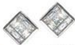
G-SRE2524-30 8TBGT = 0.24ct 10PR = 0.33ct