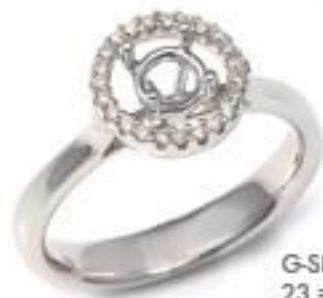
G-SRR5453-30 23 = 0.11ct