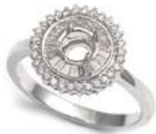
G-SRR4403-30 30RBC = 0.14ct 23TBGT = 0.19ct