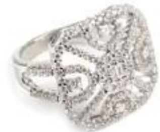
G-SRR4202-30 124RBC = 1.06ct 2TBGT = 0.05ct 4PR = 0.12ct