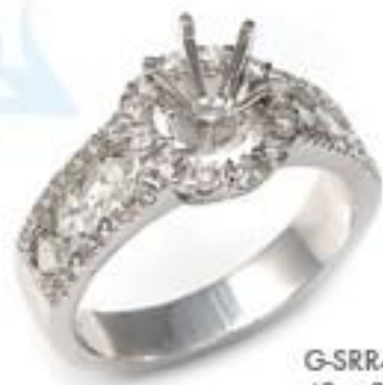
G-SRR4235-30 40 = 0.37ct 6PR = 0.42ct