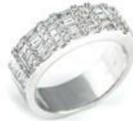
G-SRR4673-30ct 40RBC = 0.19ct 20TBGT = 0.59ct 20PR = 0.23ct