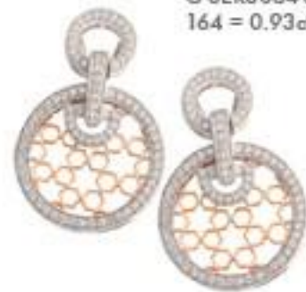
G-SER3064-30 164 = 0.93ct