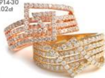
G-SGR1914-30 133 = 1.02ct