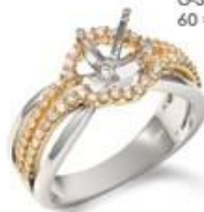
G-SGR2368-30 60 = 0.31ct