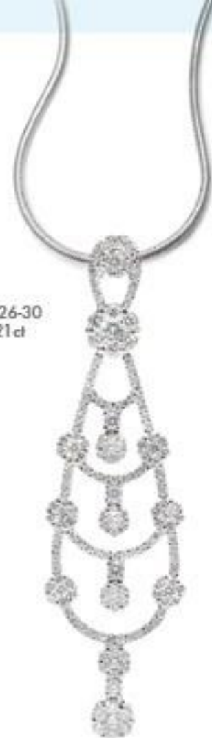
G-SRP3026-30 174 = 2.21ct