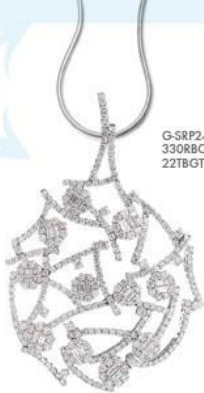
G-SRP2486-30 330RBC = 2.54 ct 22TBGT = 0.46ct