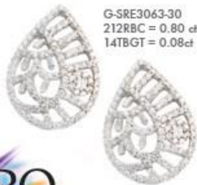
G-SRE3063-30 212RBC = 0.80 ct 14TBGT = 0.08ct