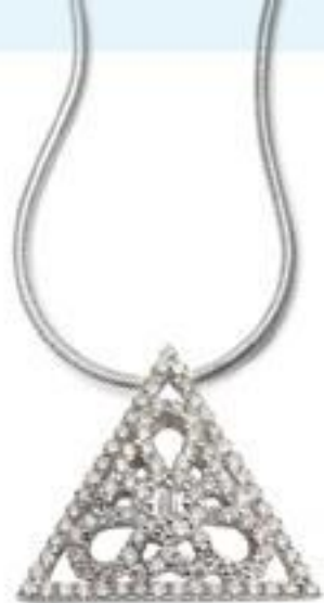
G-SRP2358-30 146RBC = 0.67ct 2TBGT = 0.05ct