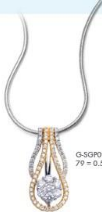
G-SGP0913-30 79 = 0.56ct