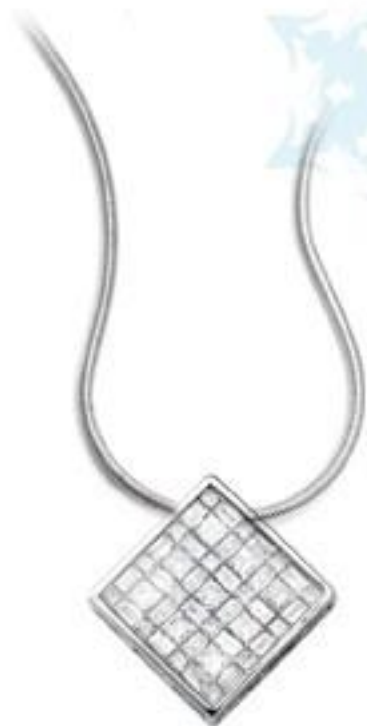
G-SRP2425-30 24TBGT = 0.83ct 25PR = 1.06ct