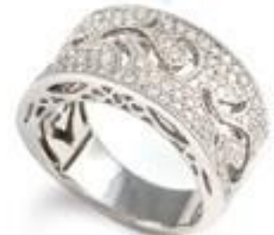
G-SGR0925-30 110 = 0.73ct