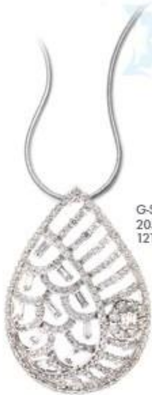
G-SRP2403-30 205RBC = 1.25 ct 12TBGT = 0.26ct