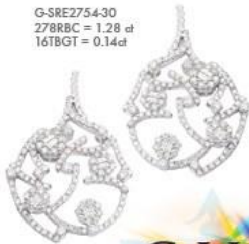
G-SRE2754-30 278RBC = 1.28 ct 16TBGT = 0.14ct