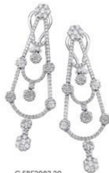
G-SRE2083-30 266 = 2.99ct