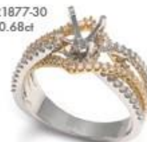
G-SGR1877-30 113 = 0.68ct