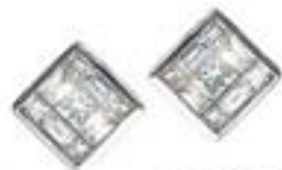
G-SRE2524-30 8TBGT = 0.24ct 10PR = 0.33ct