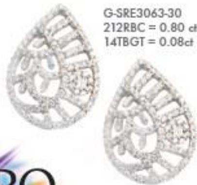
G-SRE3063-30 212RBC = 0.80 ct 14TBGT = 0.08ct