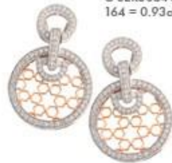
G-SER3064-30 164 = 0.93ct