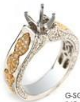
G-SGR2271-30 162 = 0.88ct