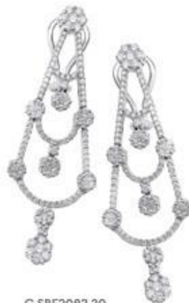
G-SRE2083-30 266 = 2.99ct