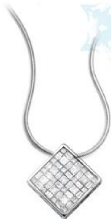
G-SRP2425-30 24TBGT = 0.83ct 25PR = 1.06ct