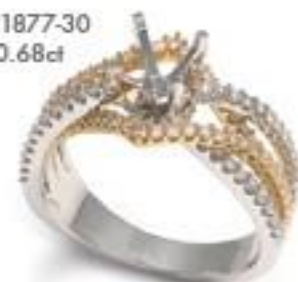
G-SGR1877-30 113 = 0.68ct