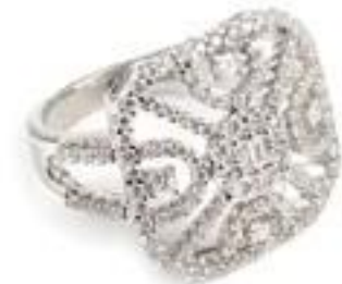
G-SRR4202-30 124RBC = 1.06ct 2TBGT = 0.05ct 4PR = 0.12ct